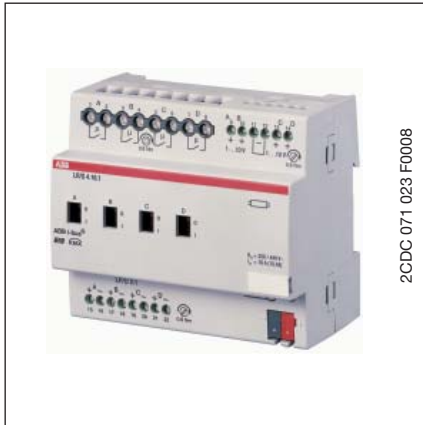
2CDC 071 023 F0008

The ABB i-bus® Light Controllers, LR/S x.16.1 (x = 2 or 4) are KNX modular installation devices in ProM Design for installation in the distribution board on 35 mm mounting rails. The connection to the ABB i-bus® is implemented via a bus connection terminal on the device shoulders.