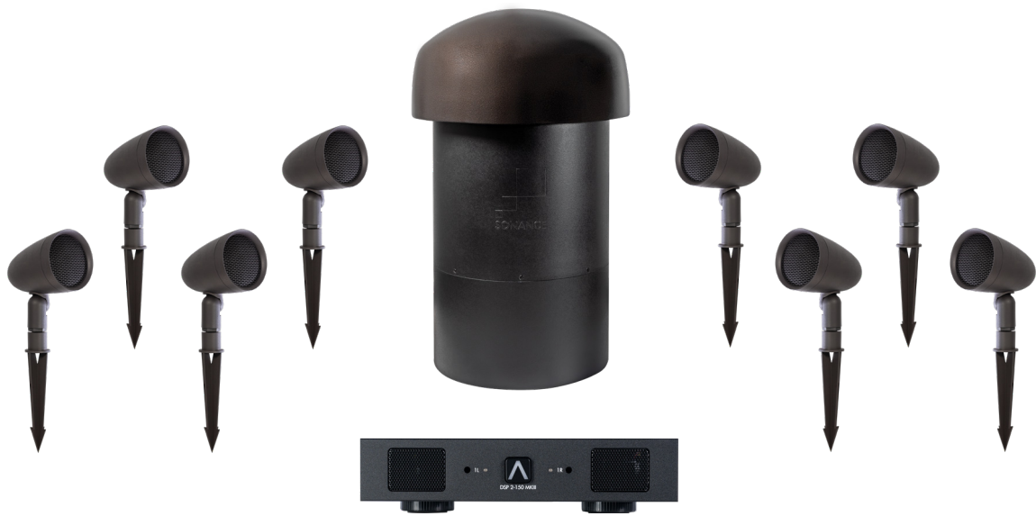
SGS System SKU 93570